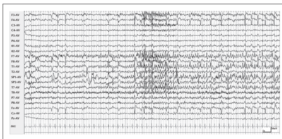
Figure 1. Left inferomesial anterior temporal ictal discharge associated with piloerection. The EEG is displayed in an average reference montage. The ictal discharge lasted 37 seconds.

Prior to hospital discharge, the patient was loaded with phenytoin orally and lamotrigine titration was subsequently initiated. Phenytoin was then tapered