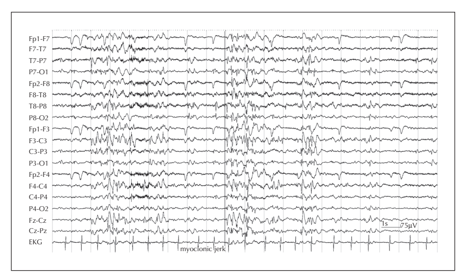
Figure 1. EEG during the myoclonic status epilepticus (before the administration of levetiracetam). Frequent myoclonic seizures correlated with a generalised and irregular polyspike pattern.